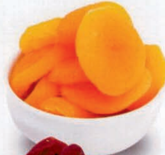
Natural Malatya Apricots